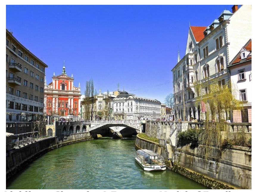
Ljubljana, Slovenia: A European Model of Excellence

In the quest for sustainability, various regions around the world have implemented successful organic waste management programs. Europe, with its commitment to environmental stewardship, has been at the forefront of such initiatives, showcasing models that can be replicated globally. Among these, Slovenia, a country with a rich natural heritage, has made significant strides in managing organic waste, demonstrating the potential for effective waste management practices in diverse settings.